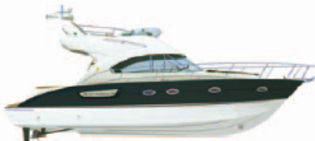
Antarès 12 Fly Cruising