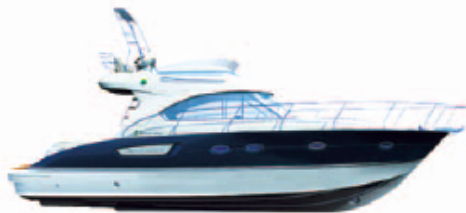
Antarès 12 Fly Sport